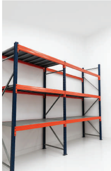
Heavy Duty Racking Systems