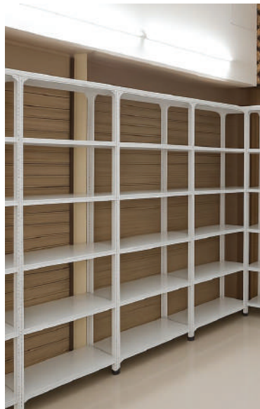
Customized Racking Designs