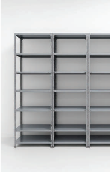
Slotted Angle Racks