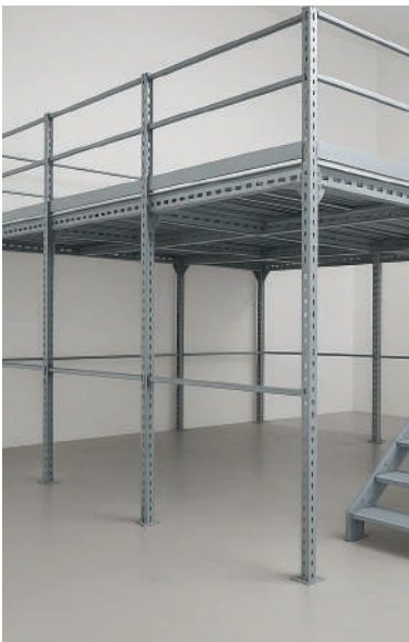
Mezzanine Floor Solutions